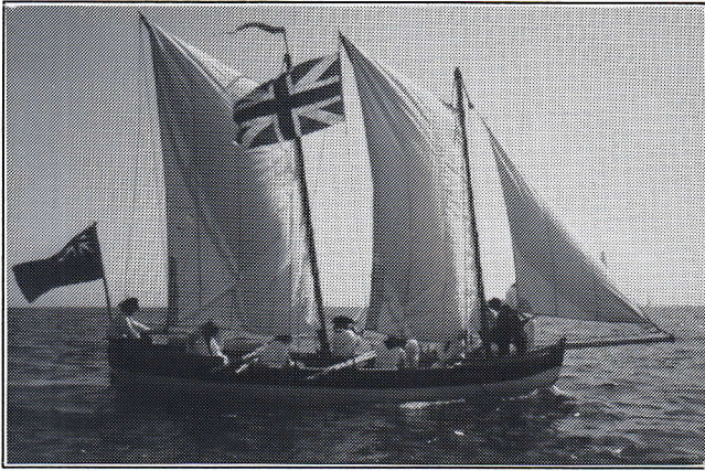
Reproduction of 1788 Bounty launch, modified rig.

During the September 10 - 12 weekend, the Heritage Launch Project participated in a commemorative re-enactment, celebrating 180 years of international peace between Canada and the United States. The event took place on and off the shores of Put-In-Bay, South Bass Island, Ohio, in the western end of Lake Erie. One hundred and eighty years ago, in 1813, the waters northwest of the islands were the scene of the Battle of Lake Erie, one of the few American naval victories.