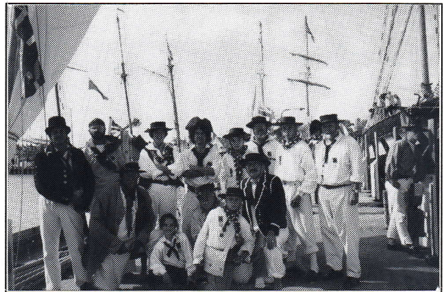
The Launch crew.

One unfortunate mishap occurred during the finale of the Toledo Symphony's rendition of Tchaikovsky's 1812 Overture. While the ships were firing their guns in time with the orchestra, a cartridge box accidentally exploded aboard the Fair Jeanne sending a gunner to hospital with flash burns. After the many generations of peace since our countries fought that senseless war, one couldn't help but reflect on the suffering our sailors and soldiers endured so many years ago.