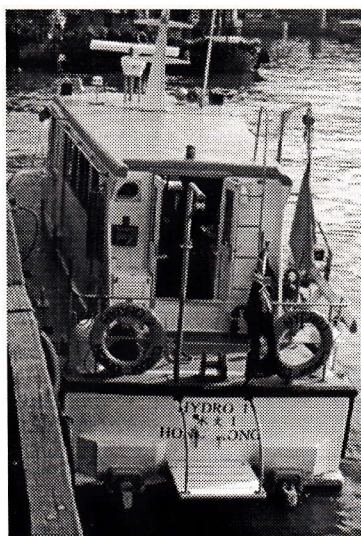
Shui Man 1 (Hydro 1)

On the boat side, our first survey launch (12 m GRP) has just been handed over following a return to the Chinese mainland shipyard for hull modifications to successfully complete speed trials (20 kts).