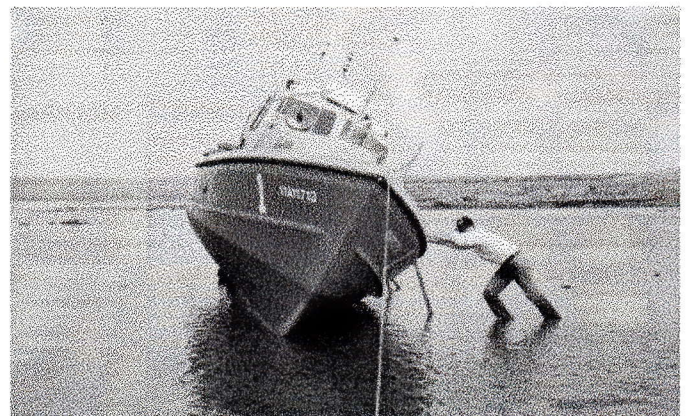
... the hazards of uncharted waters ... CSL Pintail high and dry in Rankin Inlet