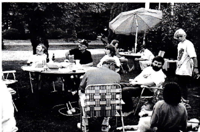
Waiting to be fed, guys?