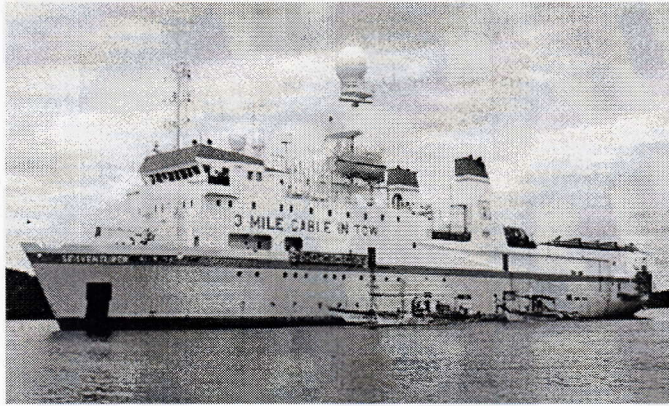
MV Seisventurer.