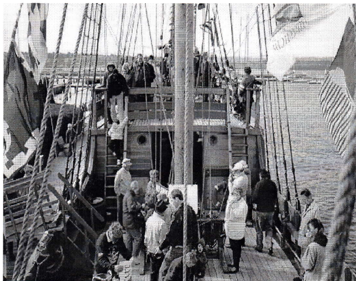
"Where did they put all their stuff?"