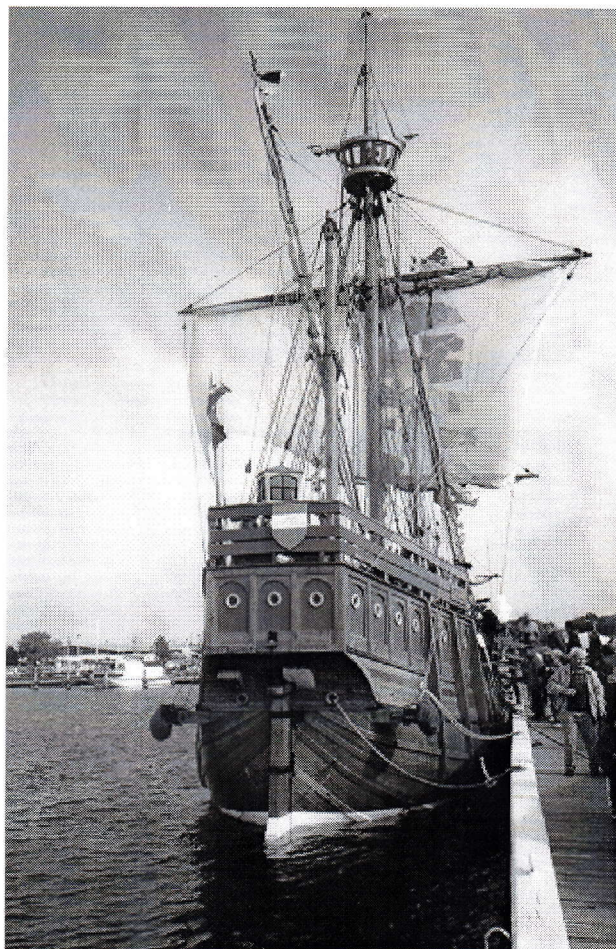
The good ship "Matthew" alongside in Hamilton.

As part of the celebration of 500 years since the discovery of Newfoundland, the replica of John Cabot's ship Matthew sailed from Bristol to Newfoundland and then visited several communities around North America.