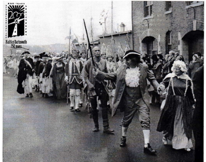
Re-enactors make their way from the waterfront to the Grand Parade.

For the Maritime participants, this was a rare opportunity to meet and share some time with colleagues and new friends from Central Branch of CHA