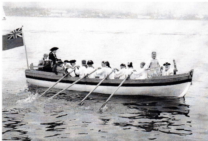
Surveyor carries the new settlers ashore

Saturday brought the greatest challenge to the Surveyor as she was called into service before the waiting public. In customary style, Surveyor and crew carried her assigned passengers safely to shore, stopping for a traditional 'oar salute' that was received with spontaneous applause from the crowd. The crew joined