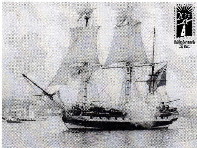
HMS Rose salutes Halifax

Two hundred and fifty years after the historic arrival of Cornwallis, Halifax again welcomed visitors ashore in longboats from a tall ship anchored in the harbour. On