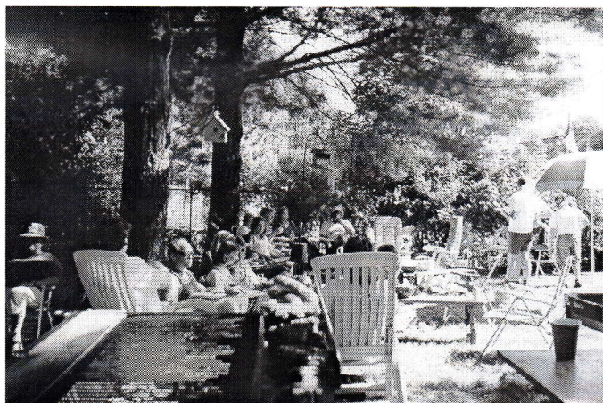
Some of the 30 participants Chase the Shade...