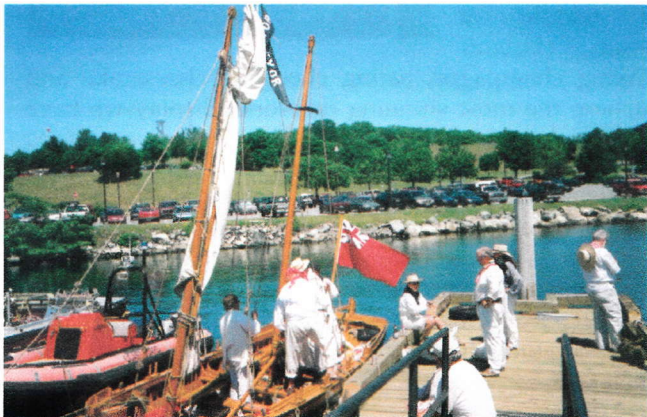
Rigging the Admiralty launch Surveyor

Surveyor and crew were welcomed on Friday July 21 with a BBQ hosted by CHS staff at BIO to kick off the Tall Ships weekend. Burgers, hotdogs and a choice of beverages were on the menu. The weather also welcomed Surveyor and crew as the festivities were enjoyed under sunny skies. After enjoying the food and refreshments, the launch was hoisted into the water and rigged dockside.