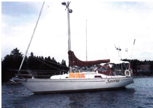
32 ft. sloop Saorsa, our home for a year.