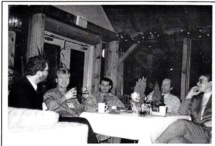
At Mimico Cruising Club, 1996

Central Branch is proud to be holding its 11 th Annual General Meeting and Dinner. This will be on Thursday December 7, 2000 at the Mimico Cruising Club on the shores of Lake Ontario.