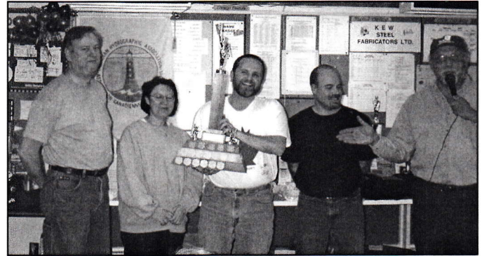
The First Place team.

Bonspiel in 2001 were unable to be here this year because they were curling in their own Bonspiel in Sarnia.